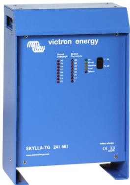
Skylla Charger 24V 50A