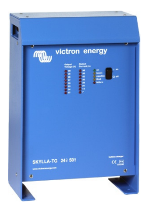
Skylla Charger 24V 50A